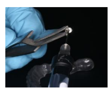
1. Dispense Bond Aligner Adhesive to the back of the appliance to be bonded.