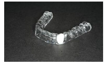
4. Thermoplastic Aligner surface is now ready for immediate placement.