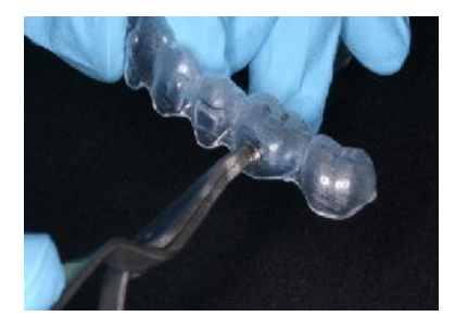
2. Apply appliance to the thermoplastic aligner surface that has been roughened with a fine diamond bur.