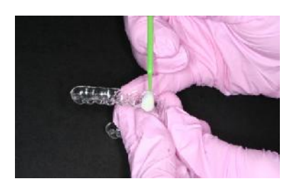
2. Apply three to four coats of the Perfect A Smile Pontic Paint to the thermoplastic aligner surface, adequately brushing over several times after each coat.

1. Mix the paint in the jar thoroughly prior to application.